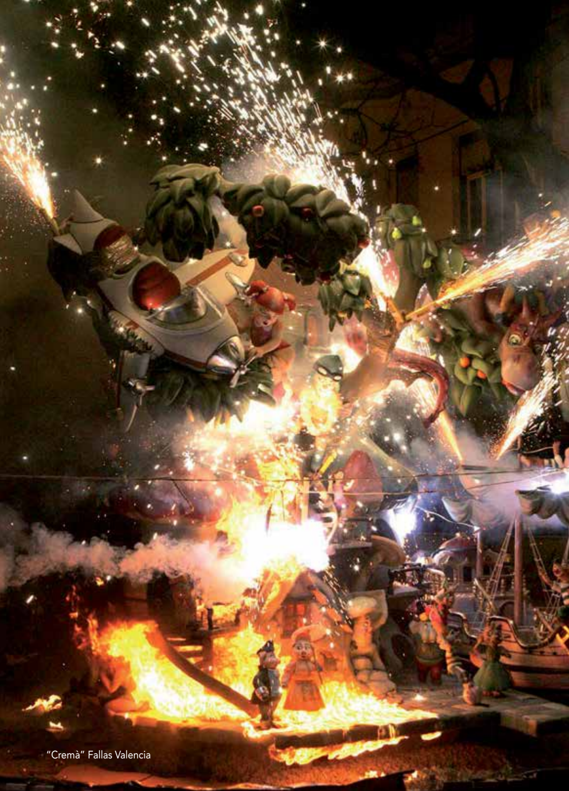
"Cremà" Fallas Valencia