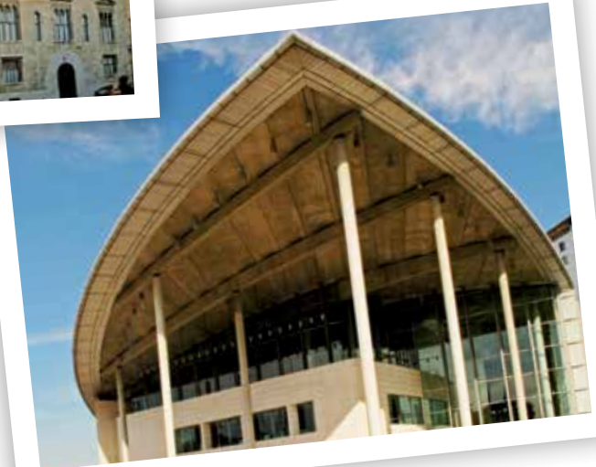
Valencia Conference Center