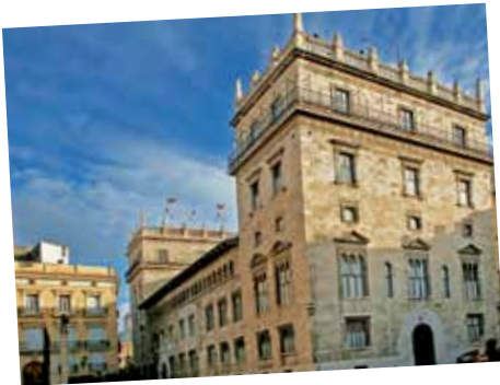
Palacio de la Generalitat Valenciana